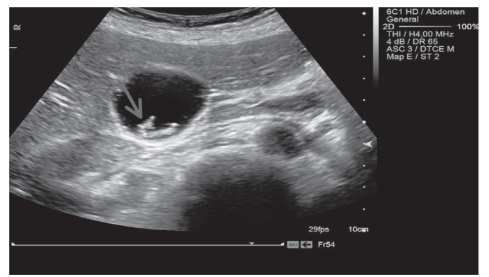
Figure 1. Ultrasonographic image of gall bladder *Red arrow shows that lineer mobile structures 15.4 mm in length considered as live parasites within the gallbladder